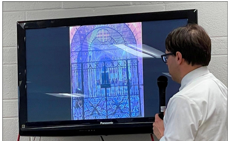
A presentation on the Holy Land Pilgrimage.