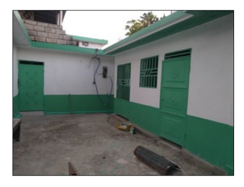
Back courtyard of clinic. Patients wait here for their medications or to see the dentist in /dental clinic at right.