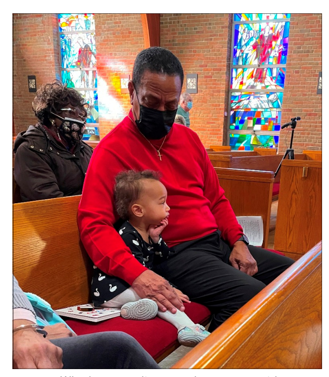
Who better to listen to the sermon with than Grandpa?