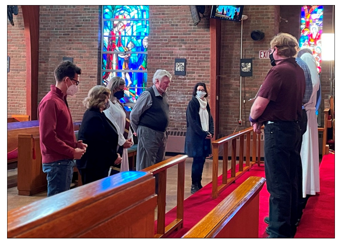
Dedicating our newly formed Healing Prayer Ministry.