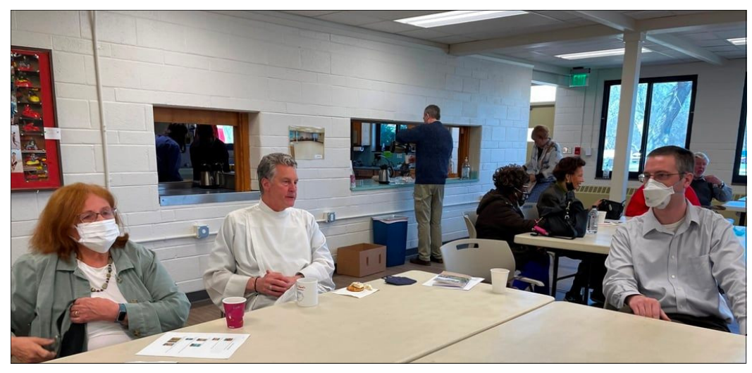
Coffee hour is back!