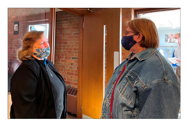
Greeting each other on the first Sunday of Lent..