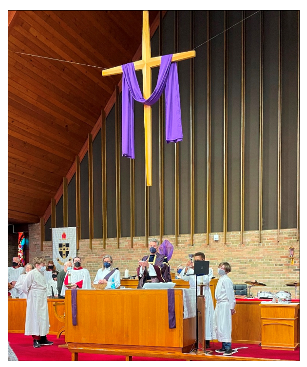
The cross is draped in purple for Lent.